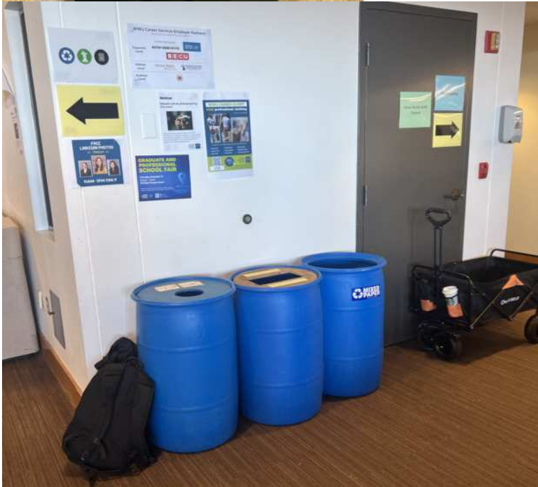
Where employers eat: