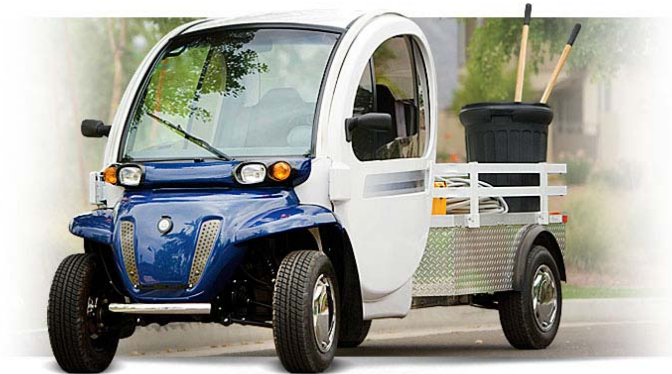
The 2012 Gem eL