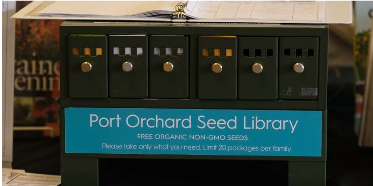
(Seed Libraries, 2023)

of seed that could be donated due to concerns around cross pollination and heirloom and organic restrictions. The most important patterns identified were the importance of online resources to educate and engage the community and reliance on donations.