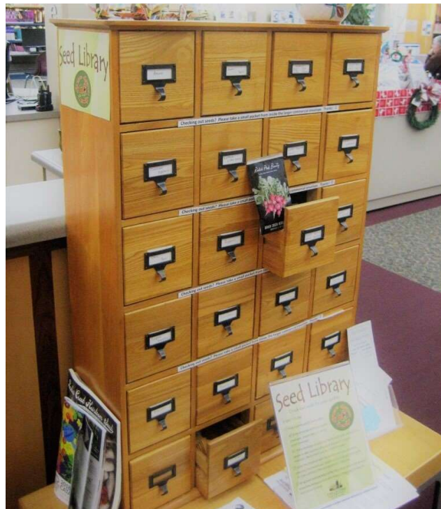
(Seed Library – ChillicoThe Public Library, n.d.)

Option C is for the library to purchase a set of wooden drawers that have short drawers, around 3-4 inches, and then add wooden dividers within the cabinet to make different rows that the seeds could sit in. This type of cabinet is readily available second hand and finding an affordable or free option could be an inexpensive choice but would require a larger amount of labor either by library staff or volunteers.