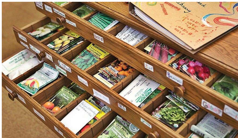
(Hammonton Now Has a Seed Library!, 2023)

The project follows the central mission of the North Central Washington Libraries: "Connecting the people of North Central Washington to vital resources and opportunities that foster individual growth and strengthen communities" (NCW Libraries 2023). Seed libraries connect communities and individuals to fresh food and shared knowledge, strengthening and growing their resilience.