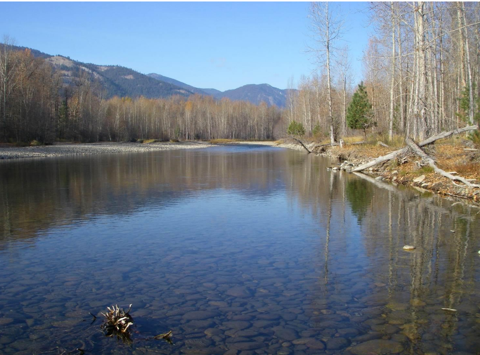
The Methow River