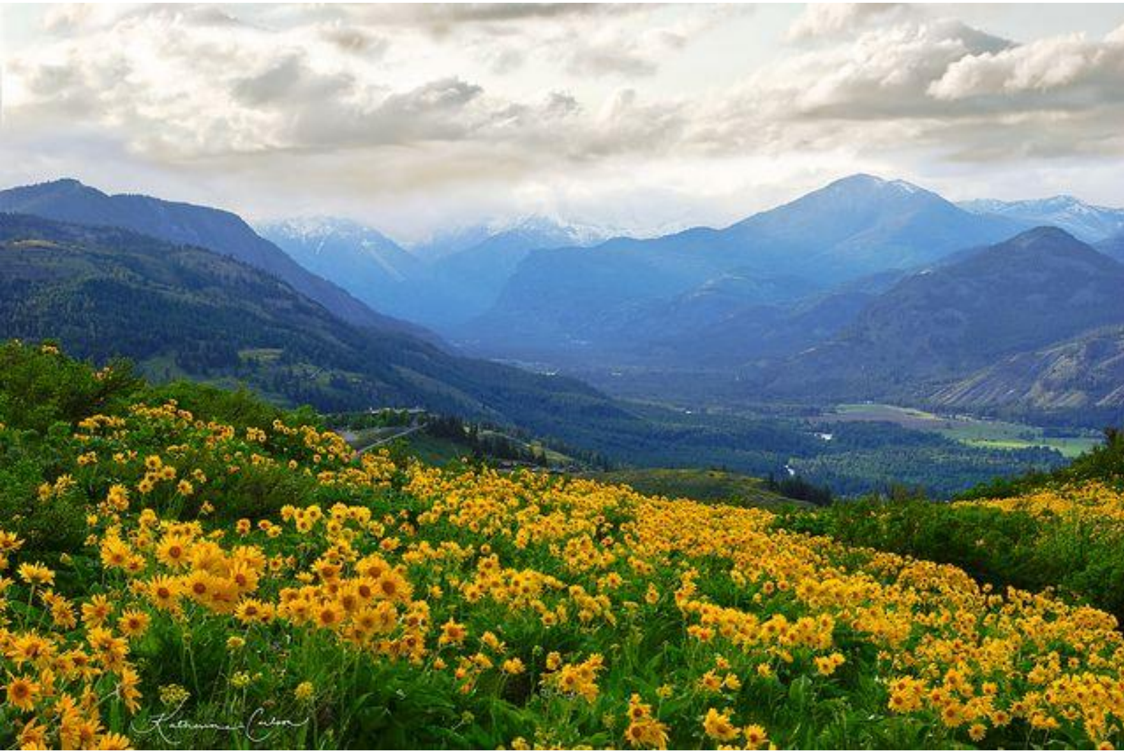
Patterson Mountain - Winthrop, WA