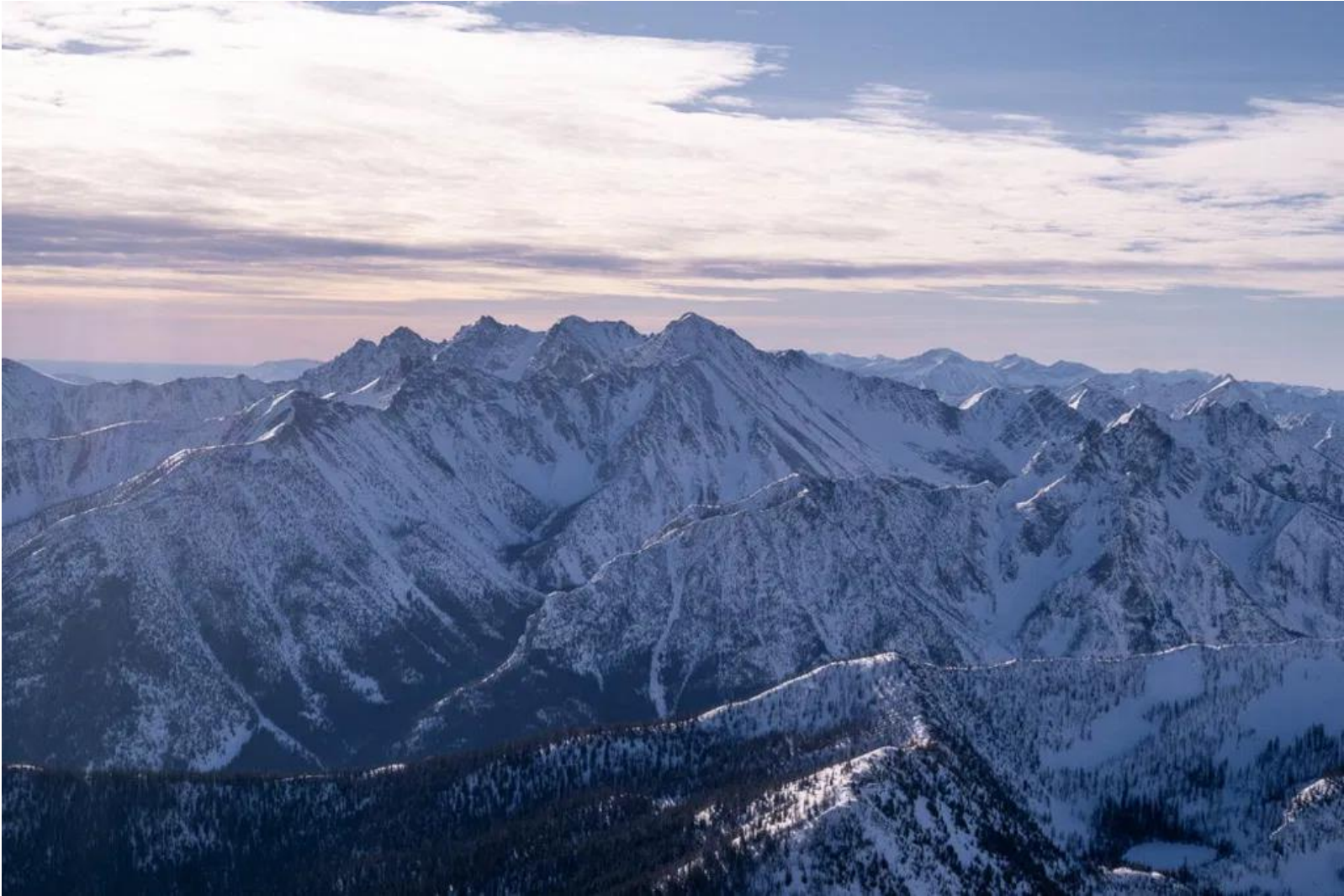
Winter in the Methow Valley - Winthrop, WA