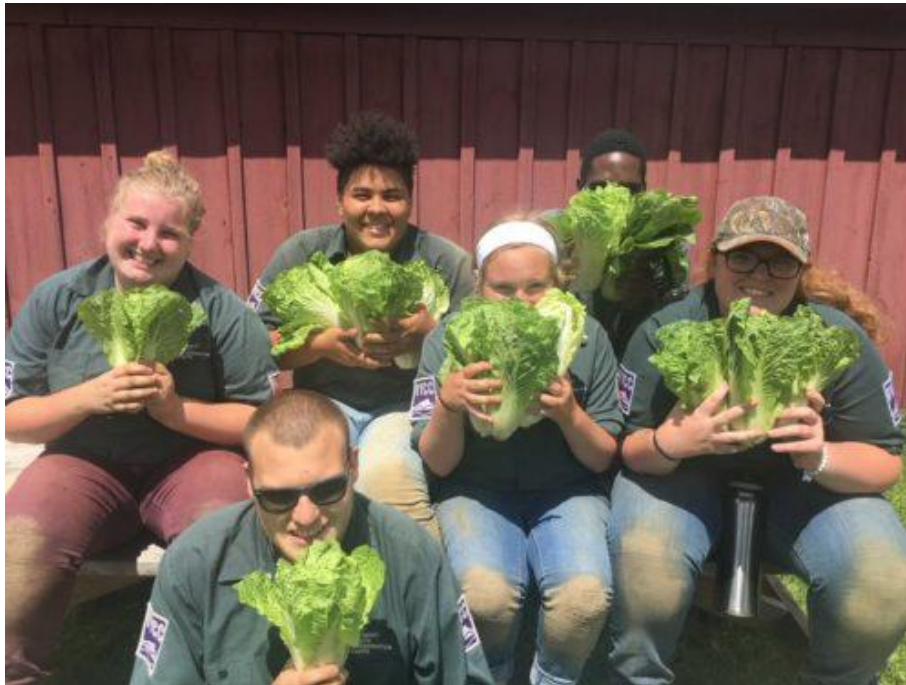
Vermont Youth Conservation Corps https://www.vycc.org/vyccalumni/

To primarily launch the OYC, grants should be used to fund the program. Application for grants can be provided by the initial stakeholders, with some flexibility in each organization's