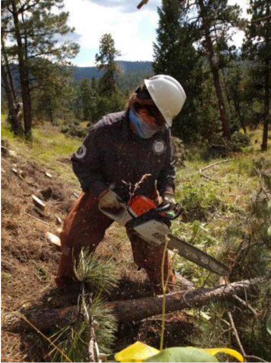
Mile High Youth Corps forestry work - https://www.milehighyouthcorps.org/report/

creating the corps. In this, these individuals provided recommendations regarding youth engagement barriers, corps sizing, funding, structure, and other working components that were considered necessary to make the recommendation for this project.