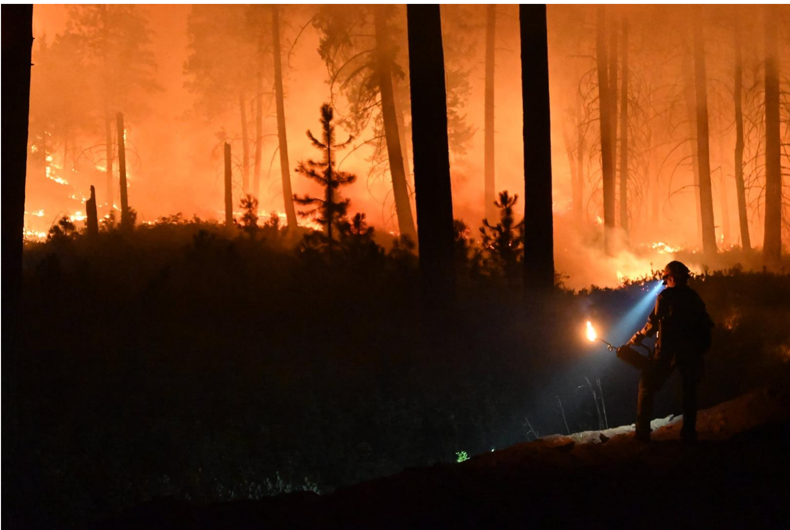
Controlled burn in Mazama, WA - Facebook: Cedar Creek and Delancy Fires 2021