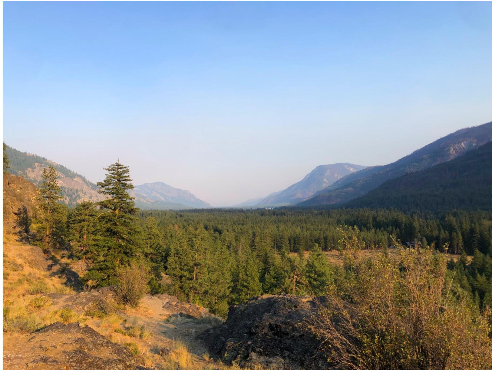
The Methow Valley viewed from Lost River Road, Mazama, WA