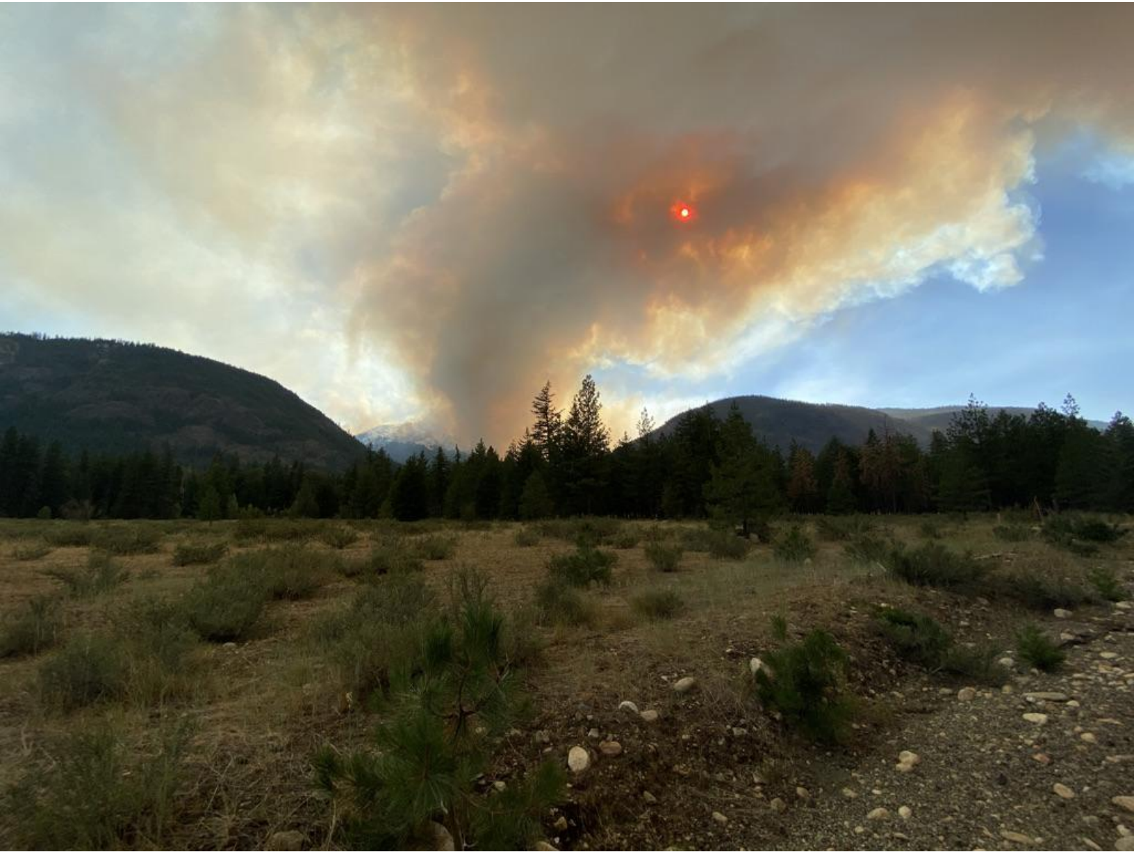
Cedar Creek Fire from Mazama, WA