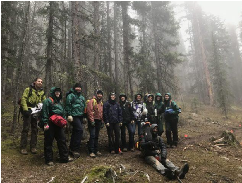
Mile High Youth Corp - https://www.milehighyouthcorps.org/report/

Full interview questions are included within the appendix of this document. What follows are the general takeaways from conversations with stakeholders and other corps leaders.