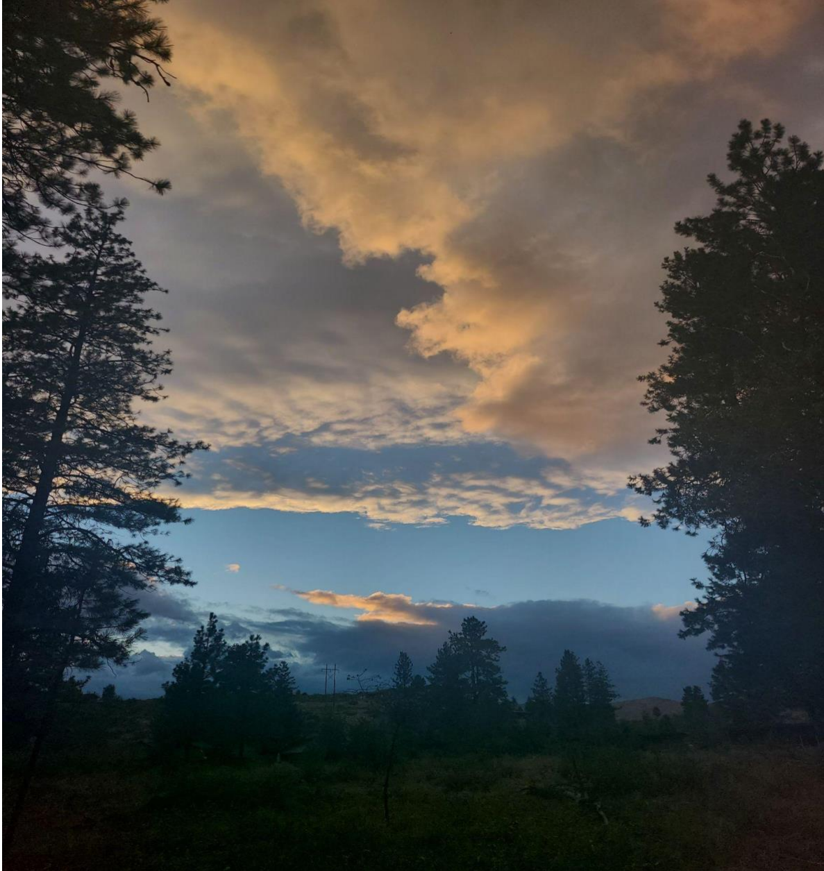
SaTeekhWa Trail in Winthrop, WA