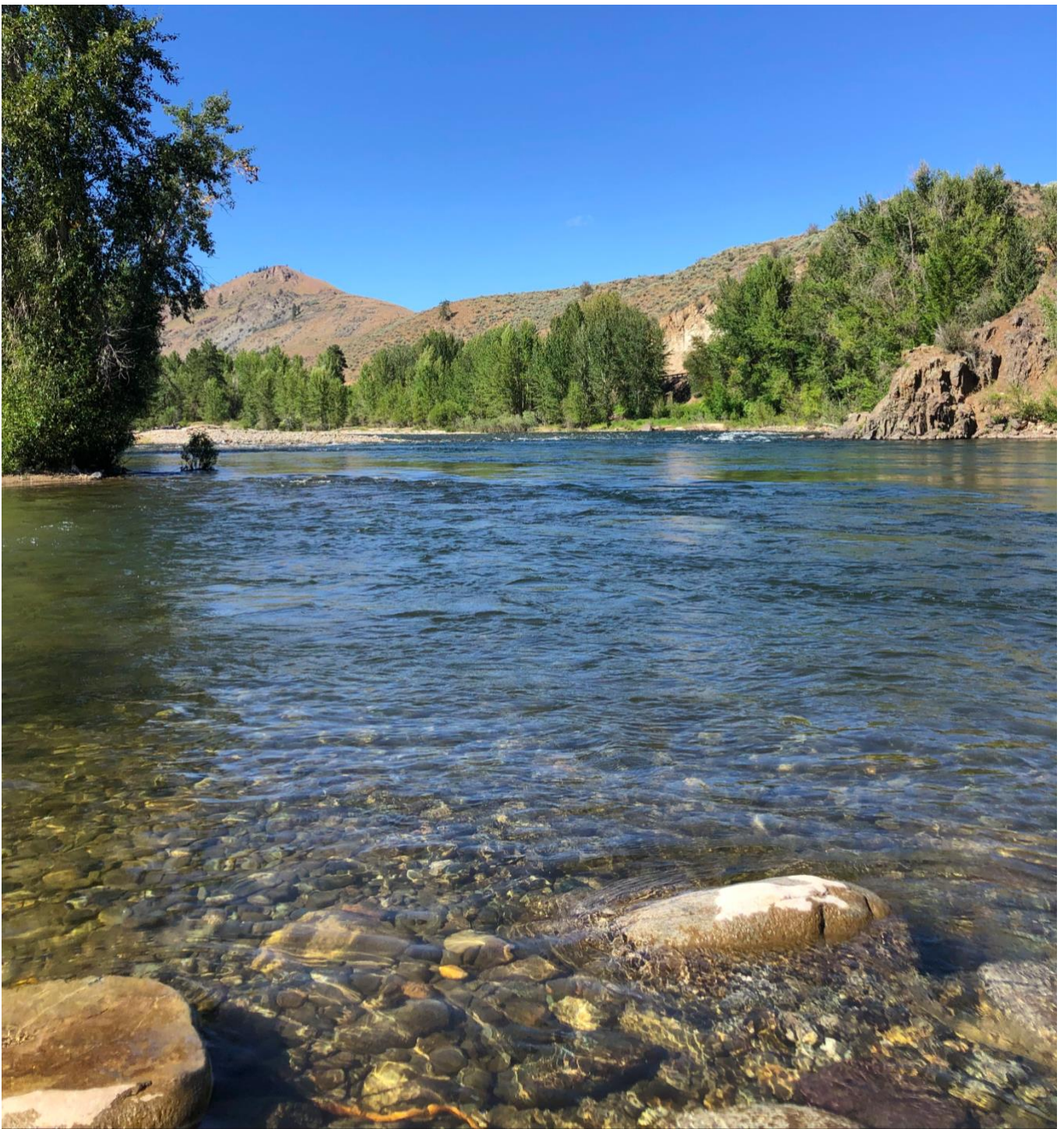
Methow River next to Twisp Park - Twisp, WA