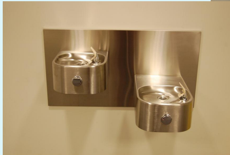
Drinking Fountain In Wilson Library