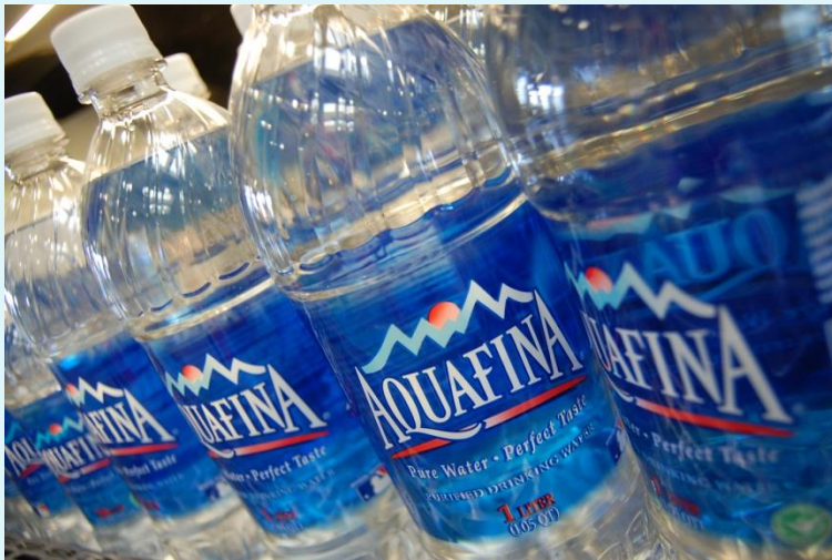
Whatcom Watershed →