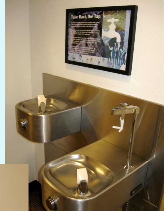
Retrofitted Drinking Fountain At Chico