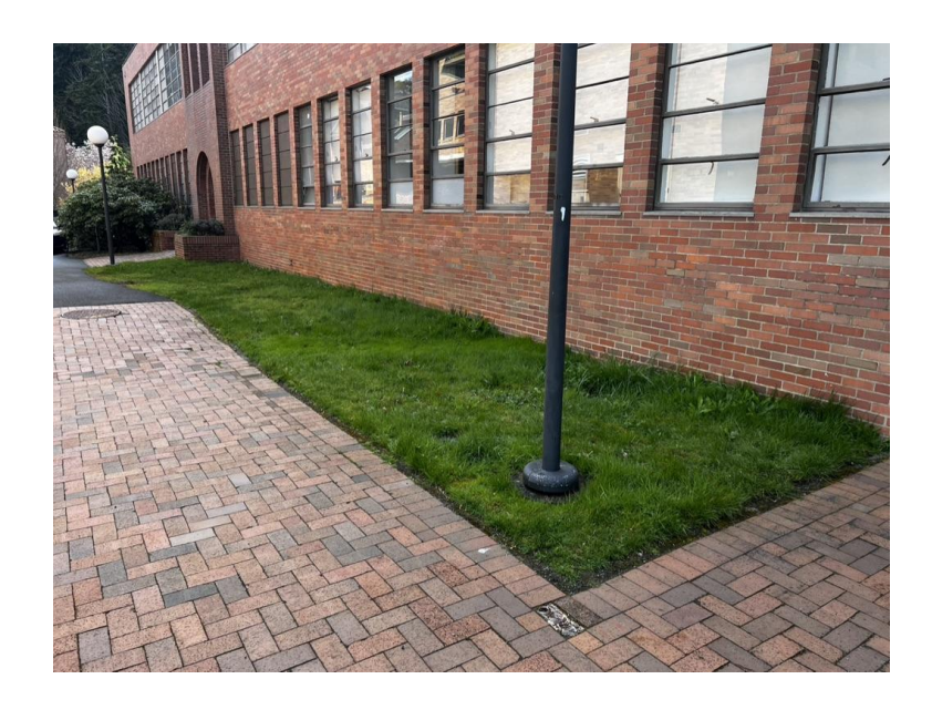
Plot by Art Annex

Native Landscapes Phase II aims to replace small and underutilized lawn spaces on Western Washington University's (WWU) campus with diverse selections of native plants. The spot we have chosen is a small, underutilized, and irrigated section of grass against the west side of the Art Annex. This spot is visible to anyone walking by, but a sign will also be pointing to the Native Landscape to clarify its location and give students more information about the plants there. The area chosen was suggested by WWU's lead gardener, Oskar Kollen, because it targets an area that outdoor maintenance was already wanting to replace. The location of this plot has proved difficult to mow as it is more removed than other lawn plots. It is also underutilized as it sits up against the building and does not get a lot of sun. The grass would be removed by the Grounds team. The native plants would be planted by group members and student volunteers in the Spring of 2024. The selected plants are Pacific Bleeding Heart (Dicentra Formosa), Pacific Rhododendron (Rhododendron Macrophyllum), and Pacific Trillium (Trillium Ovatum). These native plants were chosen for their appeal to pollinators, their aesthetic, and their growing preference for shaded areas. Once this project proves successful, other students could collaborate with Grounds to continue the project and expand to other sites.