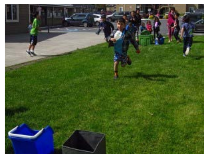
Kids play a recycling relay game to test their recycling knowledge.